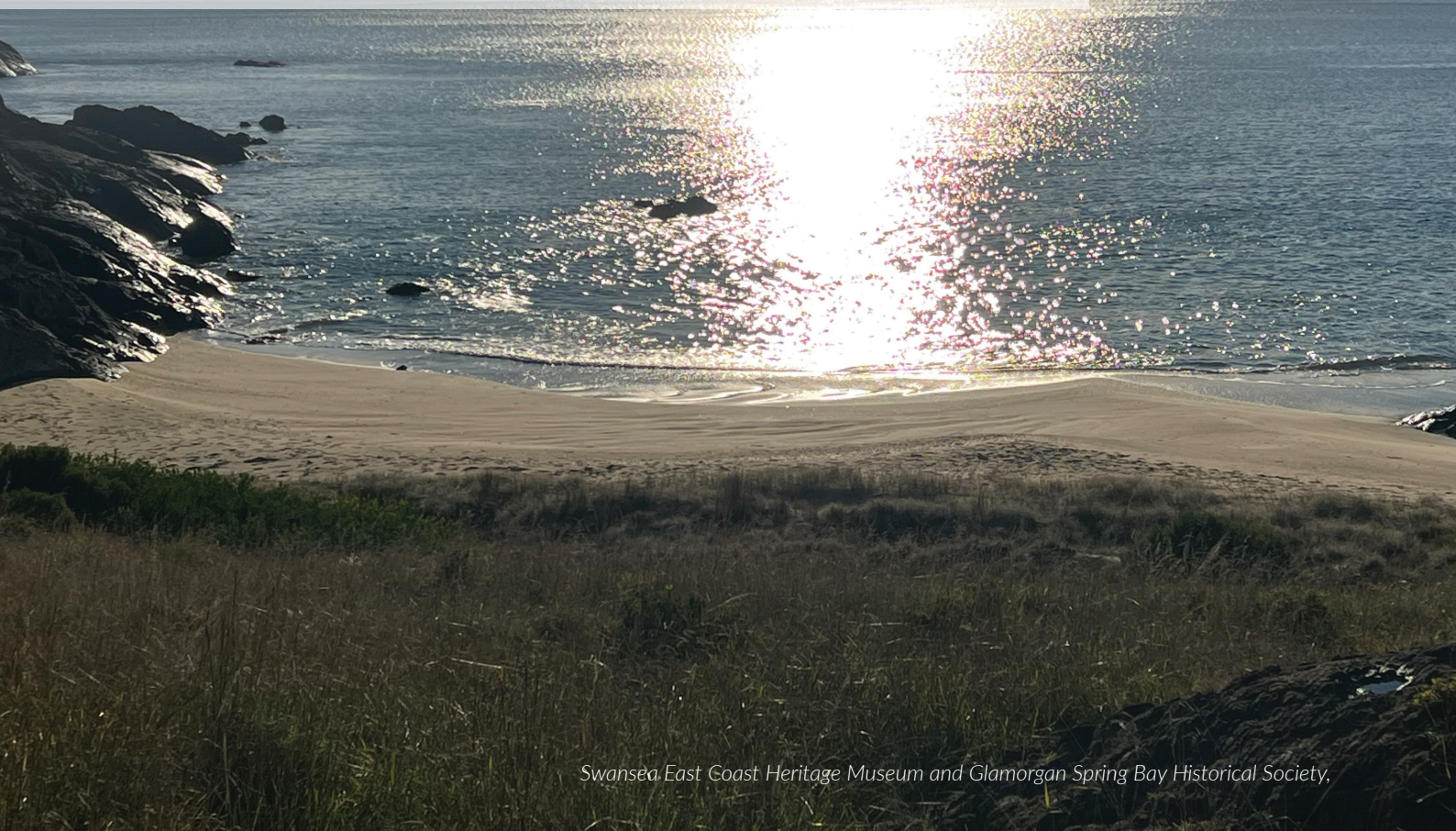
Swansea East Coast Heritage Museum and Glamorgan Spring Bay Historical Society,

Delivering high quality, cost-effective infrastructure and services that meet the needs of our communities, residents, and visitors.