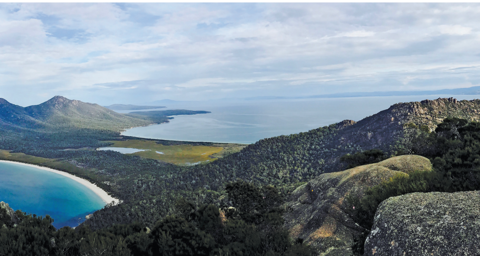
View of Wineglass Bay from The Hazards

The 2023/2024 Annual Plan demonstrates Glamorgan Spring Bay Council's commitment to providing customer focused services that improve the community's wellbeing despite the financial challenges.